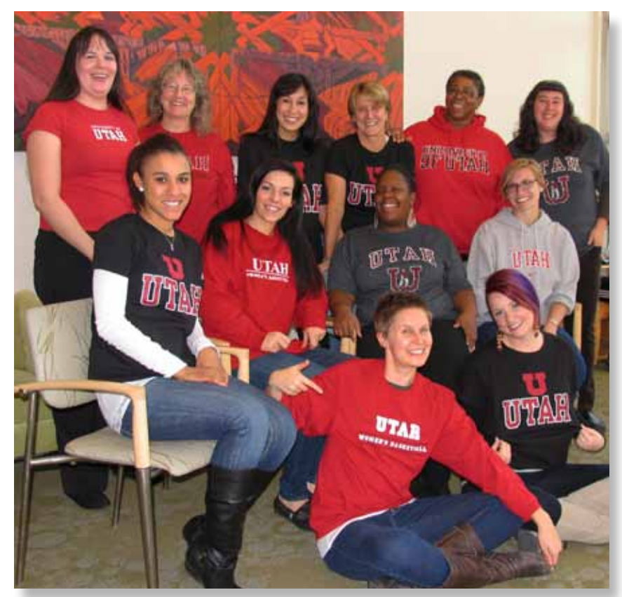
This article was authored by the staff of the WRC, pictured here.

for the university community to give up "Hoyo" at that time and transfer their affection to Swoop. But it can—and has been done. We can do this readily, positively and without rancor. And the time has come to do the right thing.