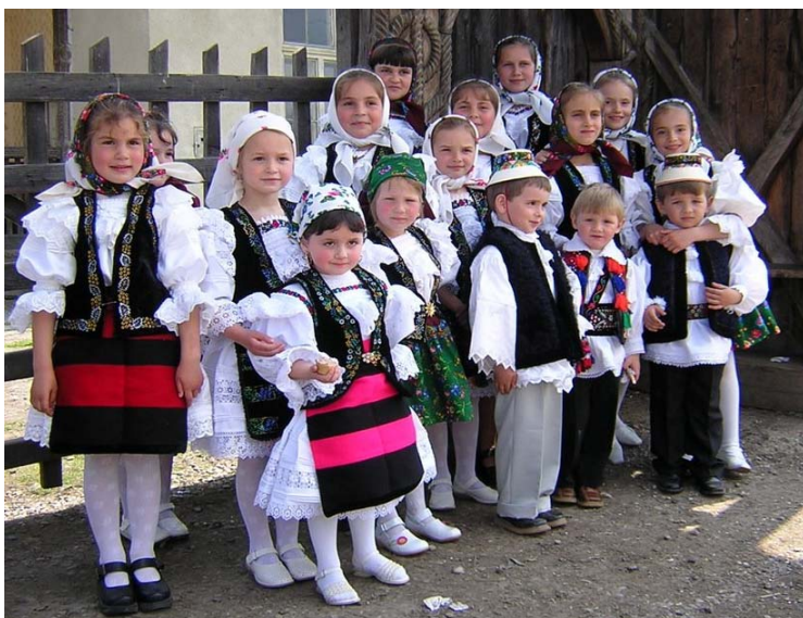
Christmas Eve Caroling in Romania

We recently asked Student Affairs staff to share their holiday traditions with our readers. The following are the received responses.