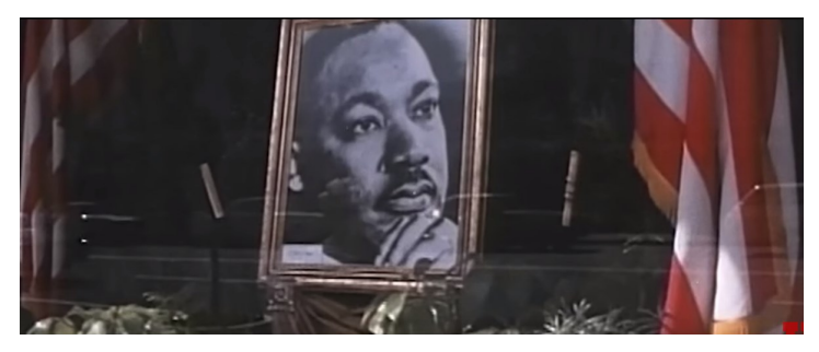
January 15 @ 2:30pm