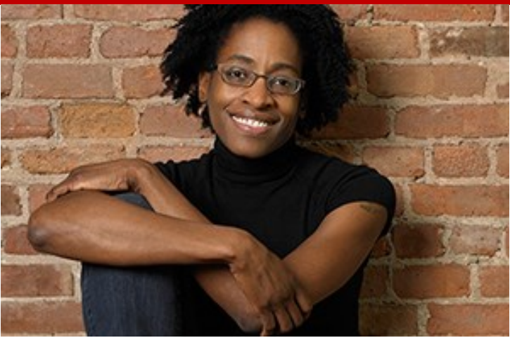
January 23 @ 12:00pm